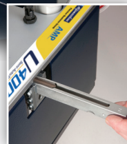
Easy rear access